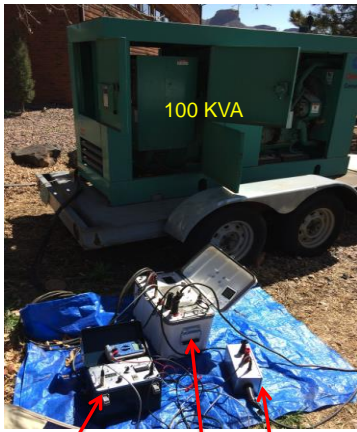
Test controller transmitter Current sensor