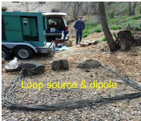
Loop source & dipole