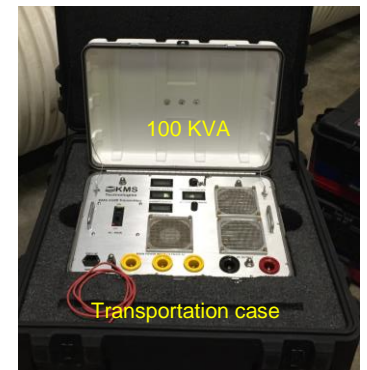
PICTURES: Initial prototype test; 100 KVA tested at 242 A; loop source (> 200 A); 150 KVA and 100 KVA production models in Colorado; 80 KVA in Texas; 5100 in transport case.