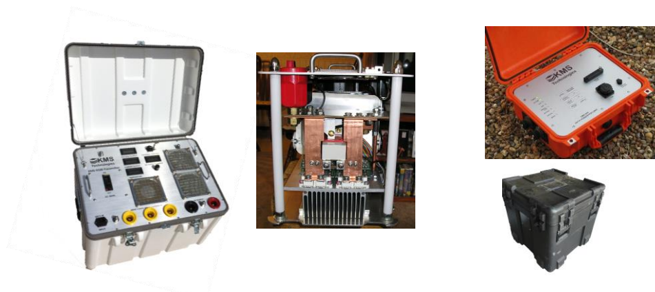
KMS-5100 land EM transmitter in portable field box; inside view; Timing and system response controller; and optional shock mounted, dustproof case (transport & field case).

The KMS-5100 electromagnetic (EM) land transmitter has been developed to provide a controlled current source for geophysical exploration techniques including Time Domain EM (LOTEM & TEM), Frequency domain and Time Domain Induced Polarization (IP) (including Time Frequency EM (TFEM)). This multi-function transmitter is ruggedized, portable, compact yet providing reliable maximum output power of 100, 150, or 200 KVA.