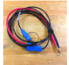
KMS-410 Lithium Ion battery in transportation case, inside view and battery cable

The KMS-410 Lithium Iron Phosphate (LiFePO 4 ) battery is the ultimate in weight versus power technology. This is a replacement for most lead-acid battery, and will require no change to your existing system. LiFePO 4 contains no poisonous lead, no acid, and does not create gasses during charge, as traditional Lead-Acid batteries do. Compared to lead-acid, Lithium Iron Phosphate batteries are also extremely light, have much lower self-discharge, do not sulfate, and are more environmentally friendly.