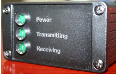
Figure 1: KMS-300 front panel