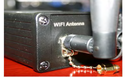
Figure 2: KMS-300 rear