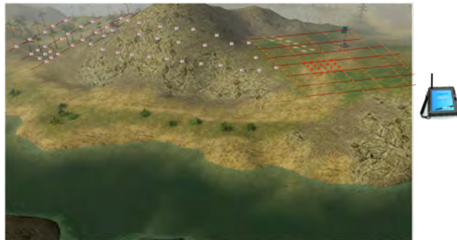
Figure 3: KMS-300 mesh network configuration