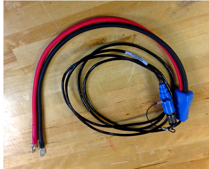
KMS-186 external lithium battery cable

The KMS-186 external lithium battery cable is developed to provide external connection from KMS-820 to lithium battery.