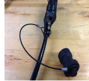
KMS-110 electrode transition cable

The KMS-110 electrode transition cable is developed to provide an adapter from the KMS-820 plug to electrode directly or electrode extension cable.