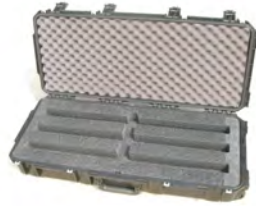
Figure 1: KMS-118 transportation case for 3 small induction coils