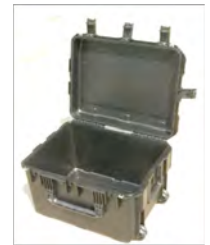
Figure 4: KMS Cable transportation case