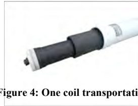
Figure 4: One coil transportation tube