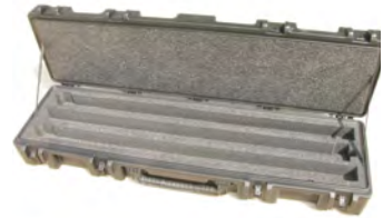
Figure 2: KMS-118 transportation case for 3 small induction coils