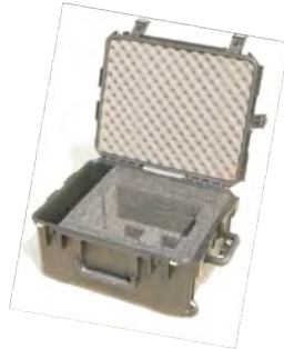
Figure 3: KMS-820 transportation case